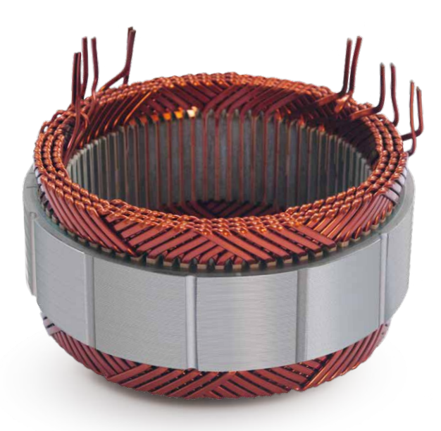
The SA1 STATOR, a radical innovation combined with a more efficient production process.

A double advantage for industry: an improvement in machine energy efficiency and a reduction in manufacturing costs.